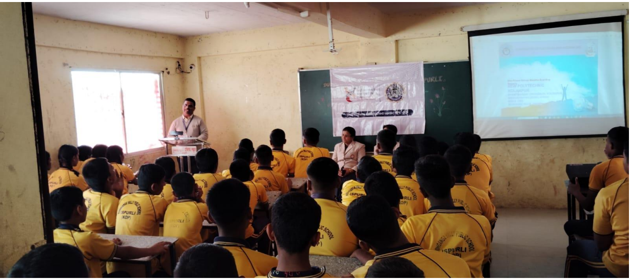
इस्पूली, ता. करवीर येथील दुधगंगा व्हॅली पब्लिक स्कूल 24 JAN 2024_