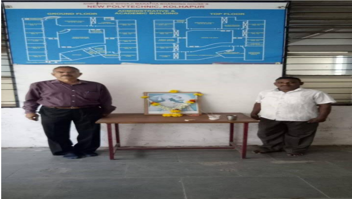
शिवराज्याभिषेक दिन celebration at New Polytechnic, Kolhapur on 6th Jun 2021.