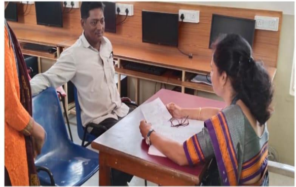
आज शनिवार दि. २१ ऑक्टोबर २०२३ रोजी इलेक्ट्रिकल इंजिनिअरिंग विभागामध्ये पालक भेट आयोजित करण्यात आली होती. याला पालकांचा उत्स्फूर्त प्रतिसाद लाभला.-Parents Meet