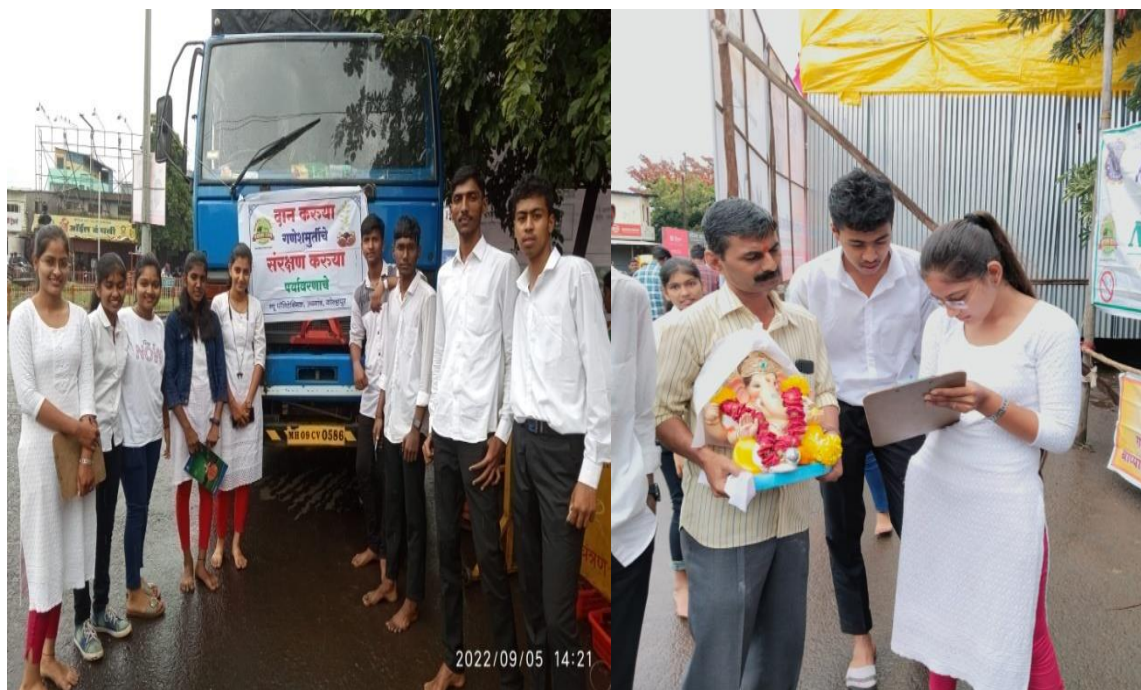
Participation of EE Dept. student in social activity "Ganapati murtidan".