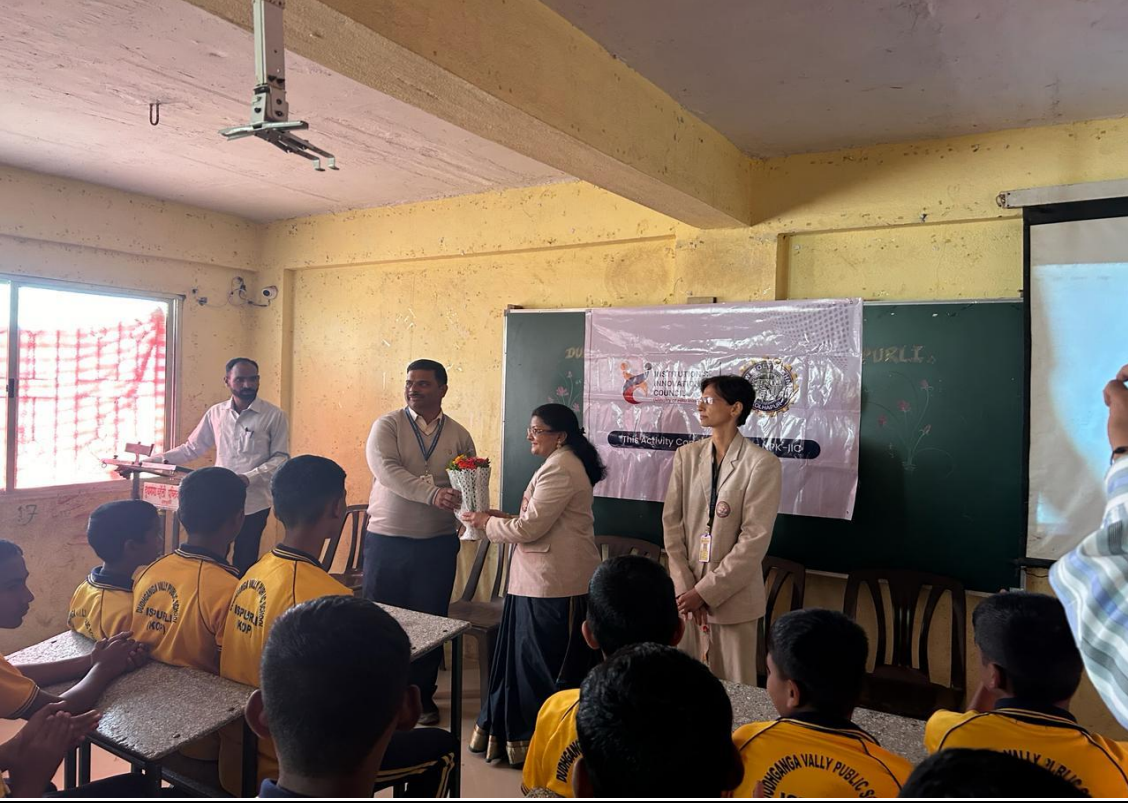
इस्पूली, ता. करवीर येथील दुधगंगा व्हॅली पब्लिक स्कूल 24JAN 2024 Conducted on day workshop on "Entrepreneurship Development" at Dudhganga Valley Public,School.