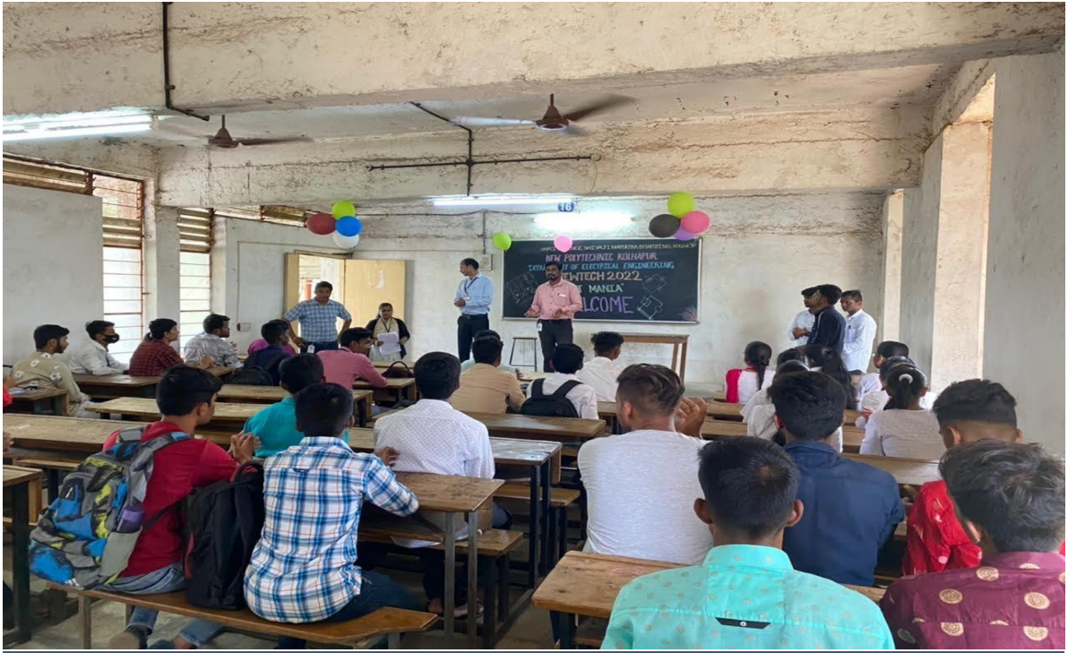
NEWTECH 2022 Round of Technical Quiz Competition