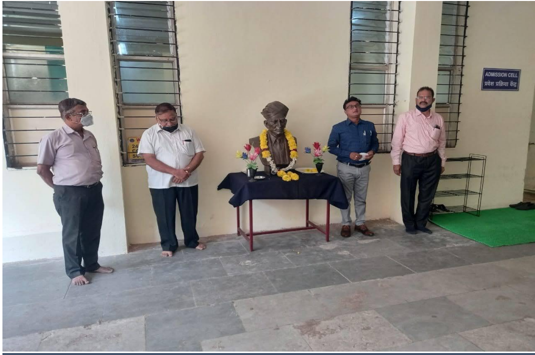
Celebration of Engineers Day at New Polytechnic, Kolhapur on 15th September 2021.