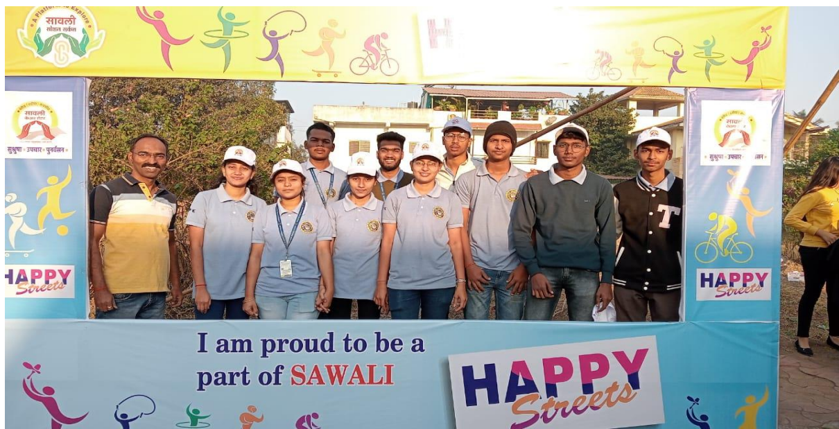
Happy Street Activity 2023, active participation of Our EE Dept. students in association with social club NPK.