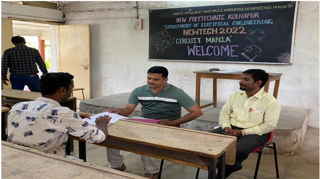
NEWTECH 2022 Final Round of Circuit Mania Competition