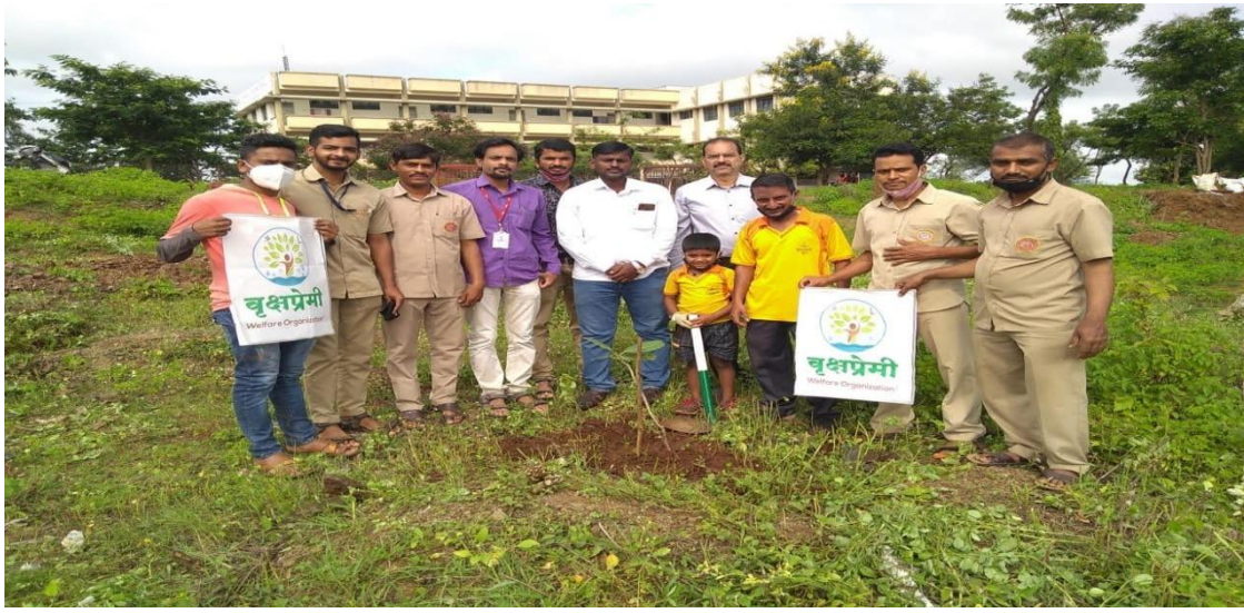
Tree Plantation on 26th June 2021 at New Polytechnic, Kolhapur