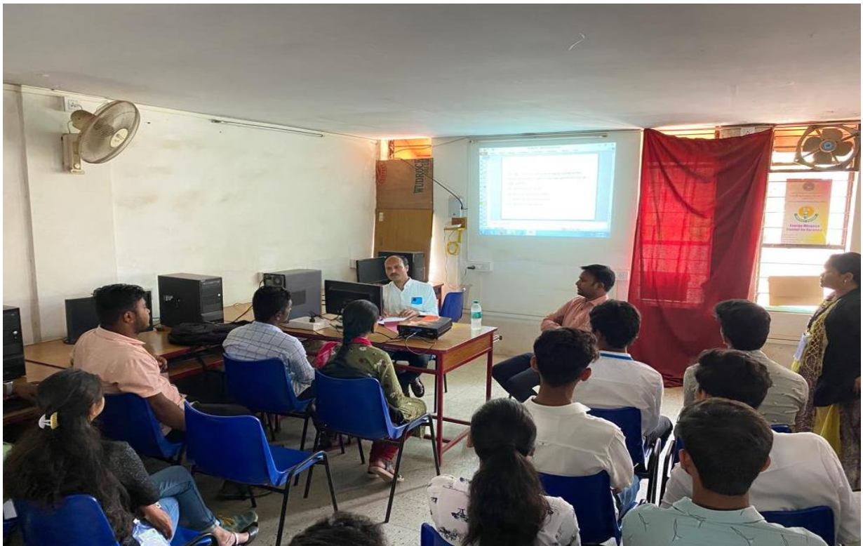
NEWTECH 2022 Final Round of Quiz Competition