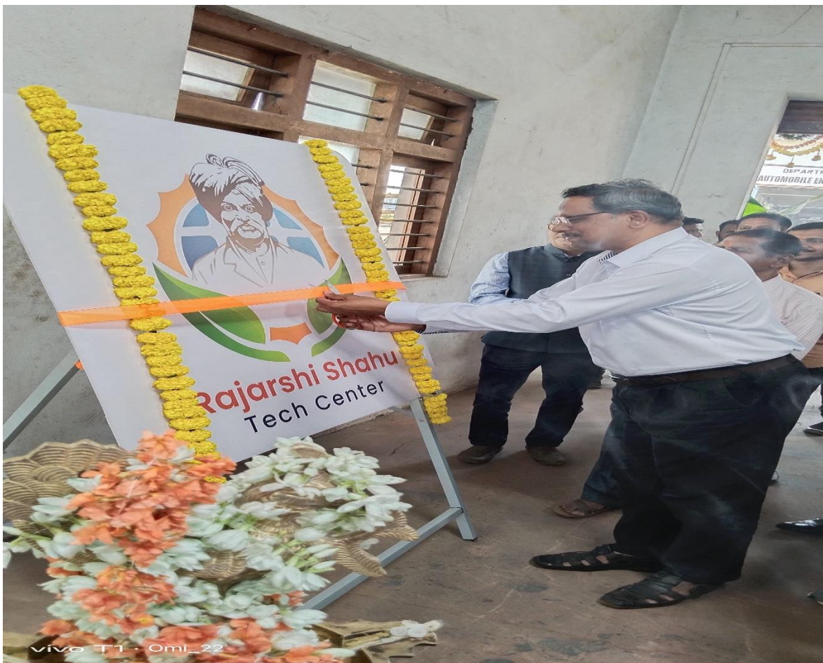
Startup of Rajarshi Shahu Tech Center under MOU in New Polytechnic, Kolhapur