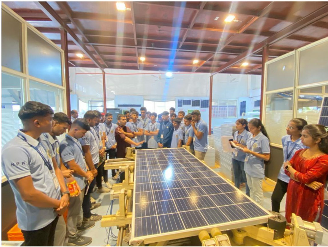
Hoshang Patel Tech. Center, Gharada Institute of Technology, (Solar Manufacturer) , Ratanagiri, Chipalun2 Maharashtra