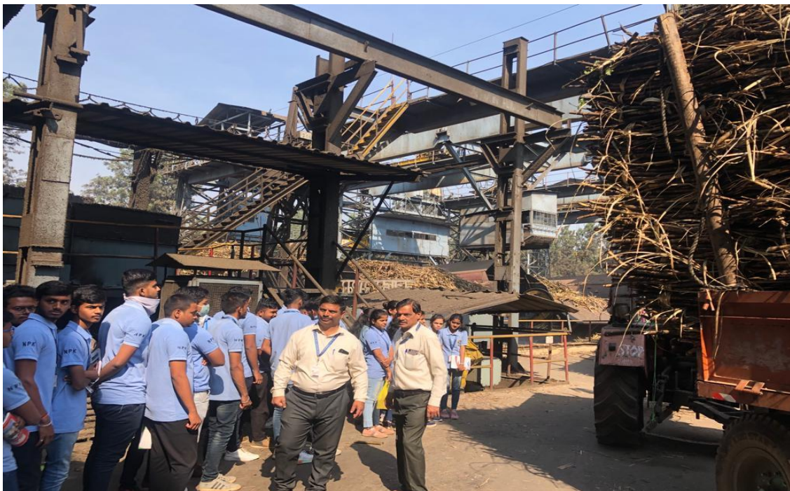
Jawahar Shetkari Sakhar Sahakari Karkhana, Hupari, Maharashtra