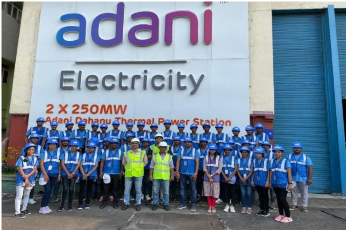
Dahanu thermal power station, Thane,