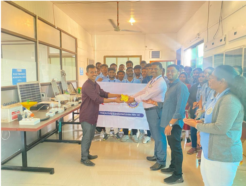
Hoshang Patel Tech. Center, Gharada Institute of Technology, (Solar Manufacturer), Ratanagiri, Chipalun, Maharashtra