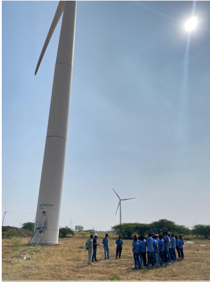
Renew Green WindMills, Waifale, Tasgaon, sangali1, Maharashtra