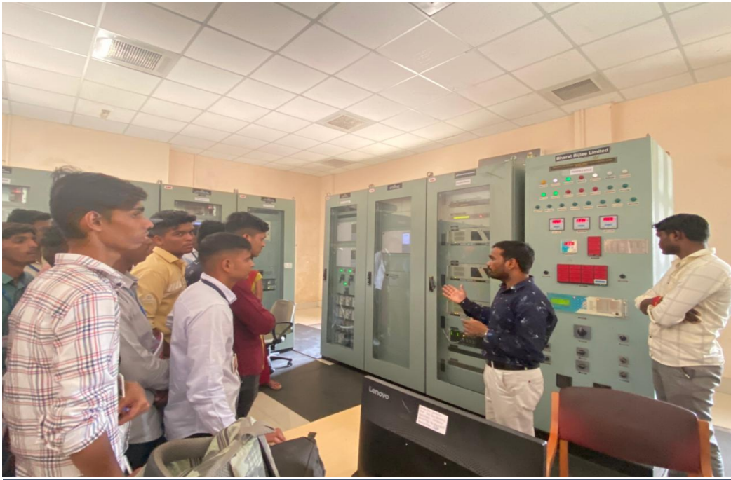
Educational visit at Wind World Pvt. Ltd. Kaledon on 13th to 16th May 2022