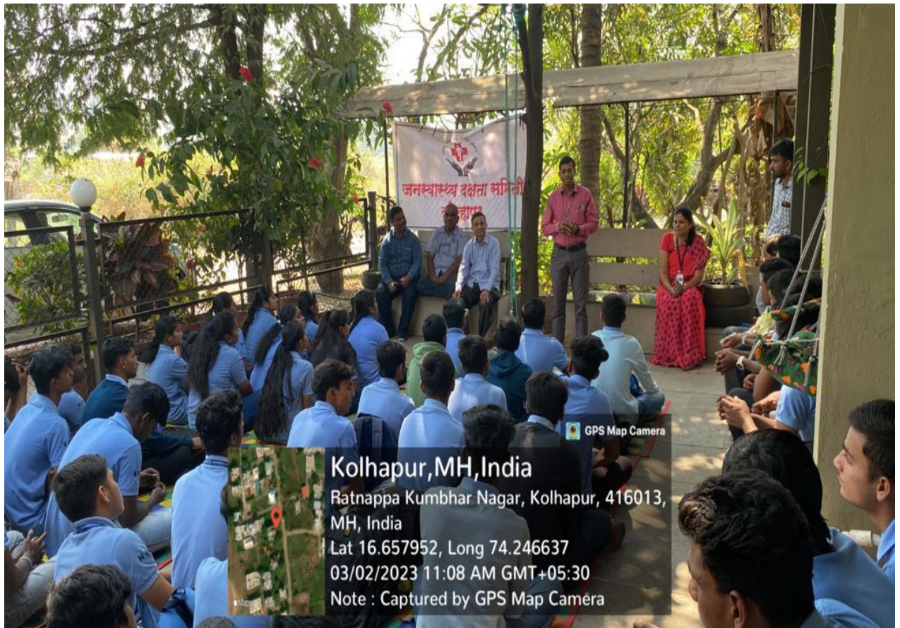
Anandvan, A-17, Dhanavatinagar, Near Mahada Colony R K Nagar, Kolhapur.