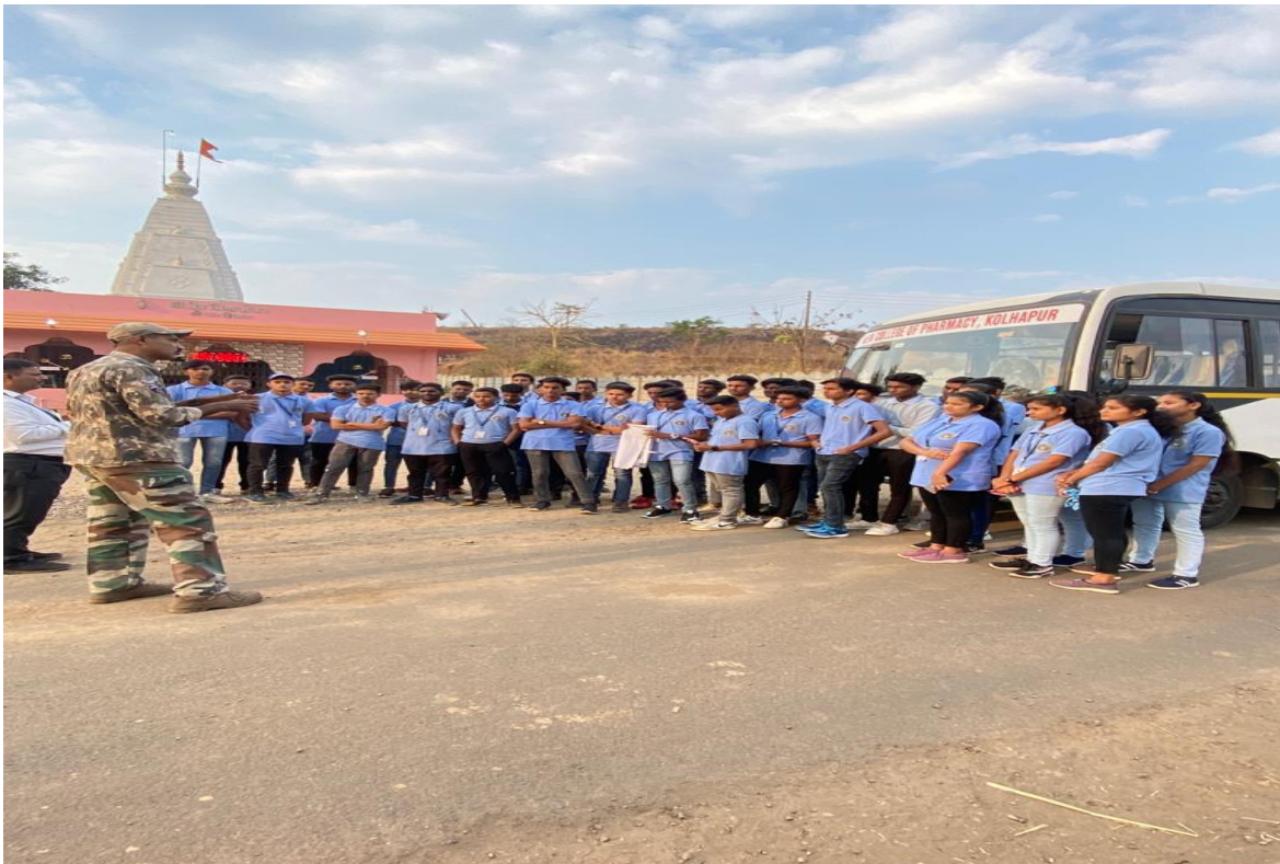
Devrai in Bhudargad taluka, Mouni Maharaj Math Rangangad (Environmental Studies)