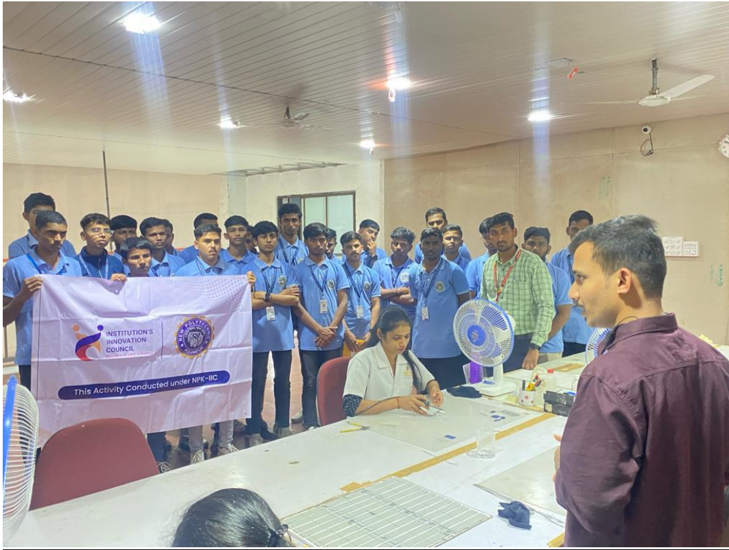
Hoshang Patel Tech. Center, Gharada Institute of Technology, (Solar Manufacturer) , Ratanagiri, Chipalun, Maharashtra