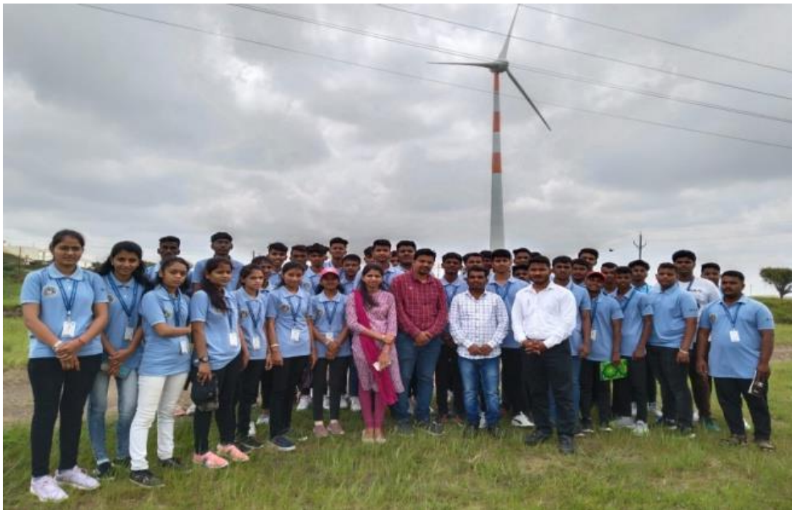
Wind World (India) Ltd. Kaledhon Site, SH143, Mulikwadi, Dist: Satara