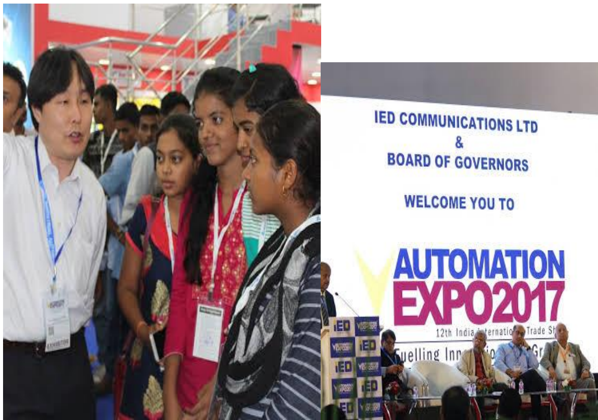
International Automation Expo students visit at Mumbai EE department.