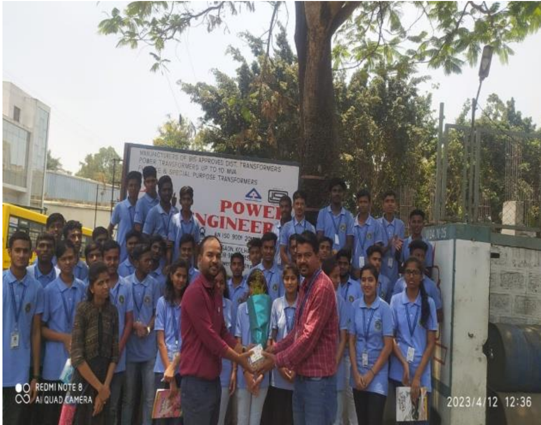
Power Engineering, MIDC, W-24, 25, GokulShirgaon, Maharashtra 416234