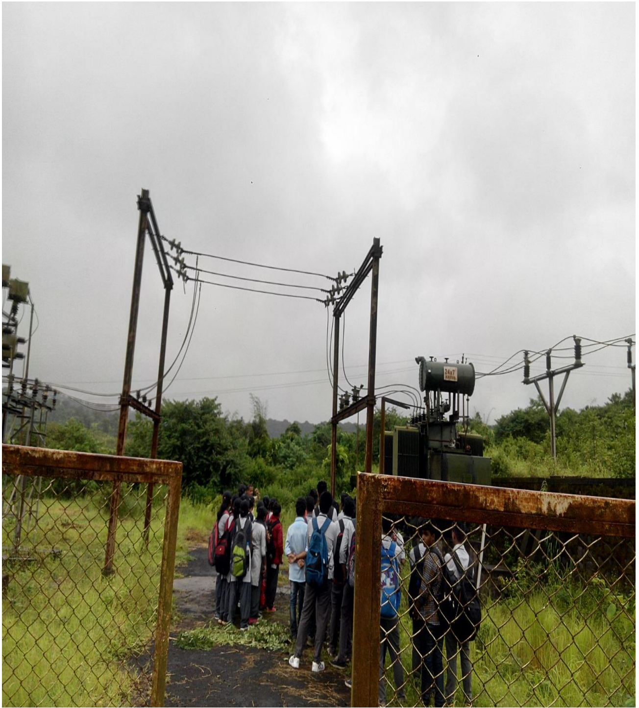
Last year student's educational visit at Substation.