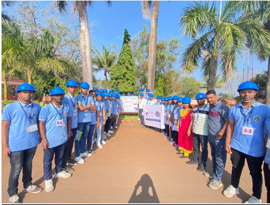
Finolex Industries Ltd, Power Generation plant, Ranpar, pawas road Rathnagiri, Maharashtra