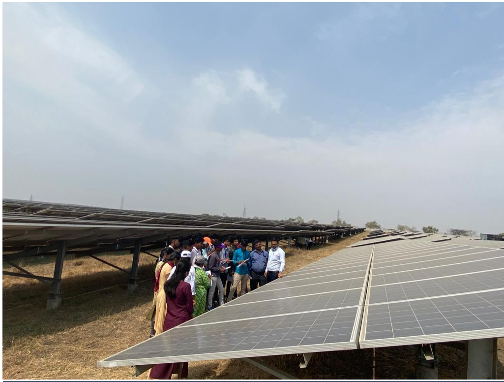
Educational visit at 36MW Mahagenco Solar Power Plant, Shirshuphal on 13 th to 16 th May 2022