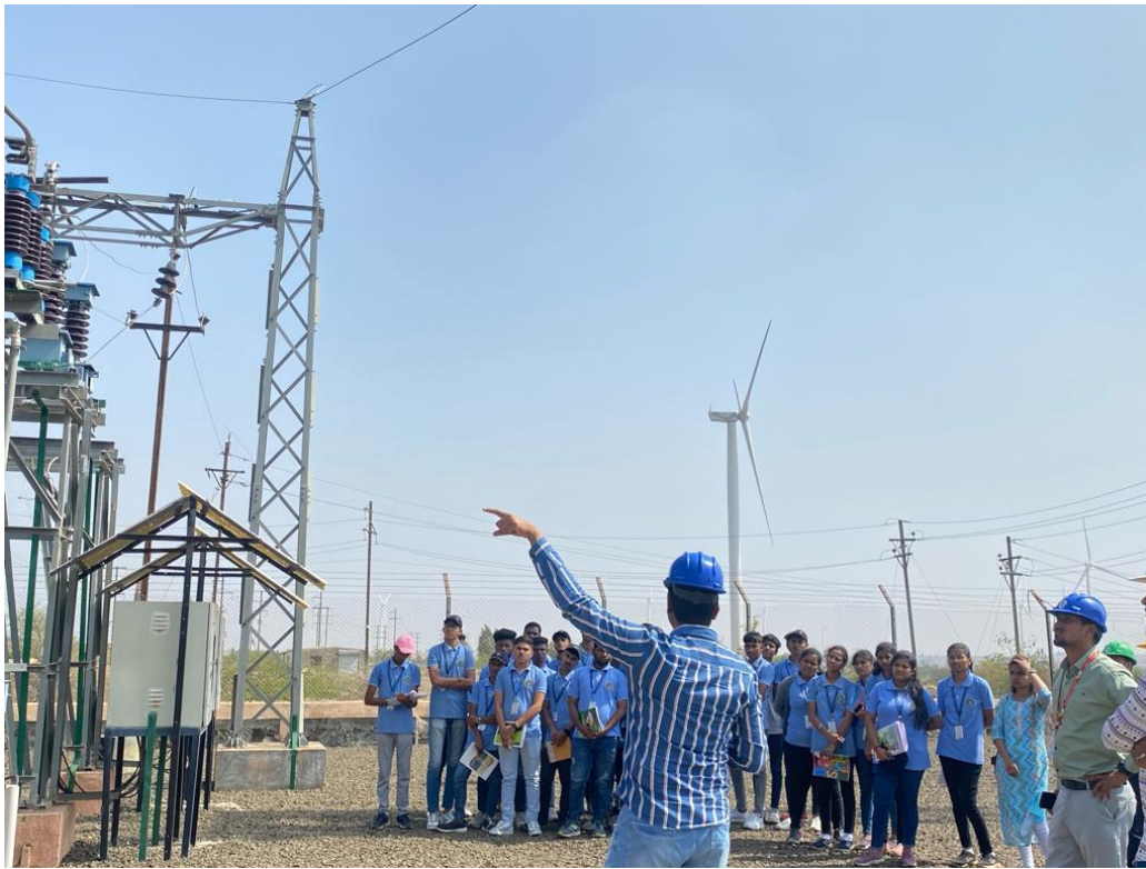
Renew Extra High Voltage Power Substation, Walsang road, Jath Sangali, Maharashtra