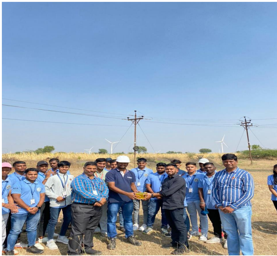
Renew Green WindMills, Waifale, Tasgaon, sangali, Maharashtra