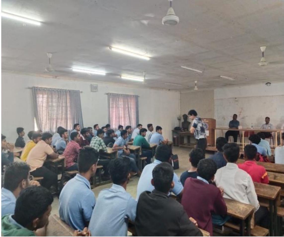
Personality Development for Electrical Department students( soft skill )