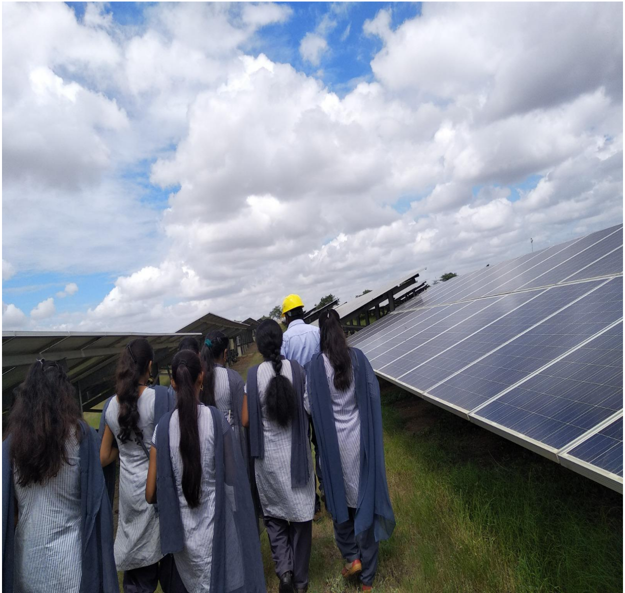
Visit to 50 MW solar power plant shirsufhal,baramati