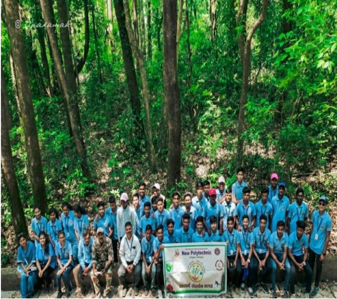
Devrai in bhudaegad taluka, Mouni maharaj math, rangangad.