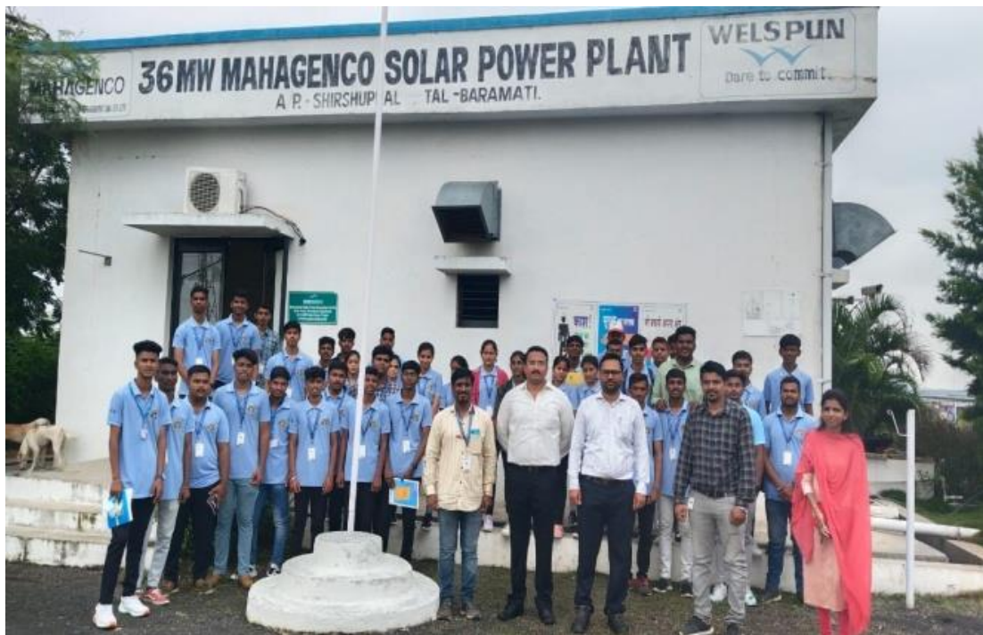
36 MW Mahageneco Solar Power Plant A .P. Shirshuphal Tal-Baramati