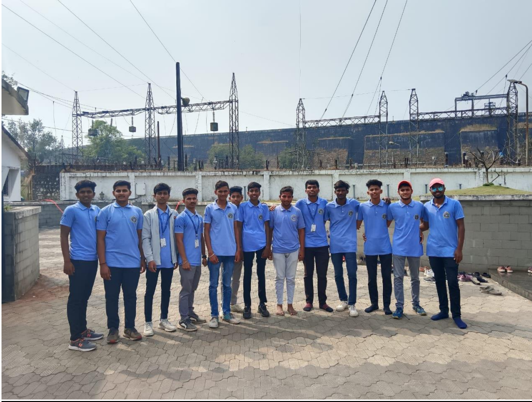
22 10 2023 R. M. Mohite Hydro Power Plant-2 Radhanagari, Kolhapur, Maharashtra