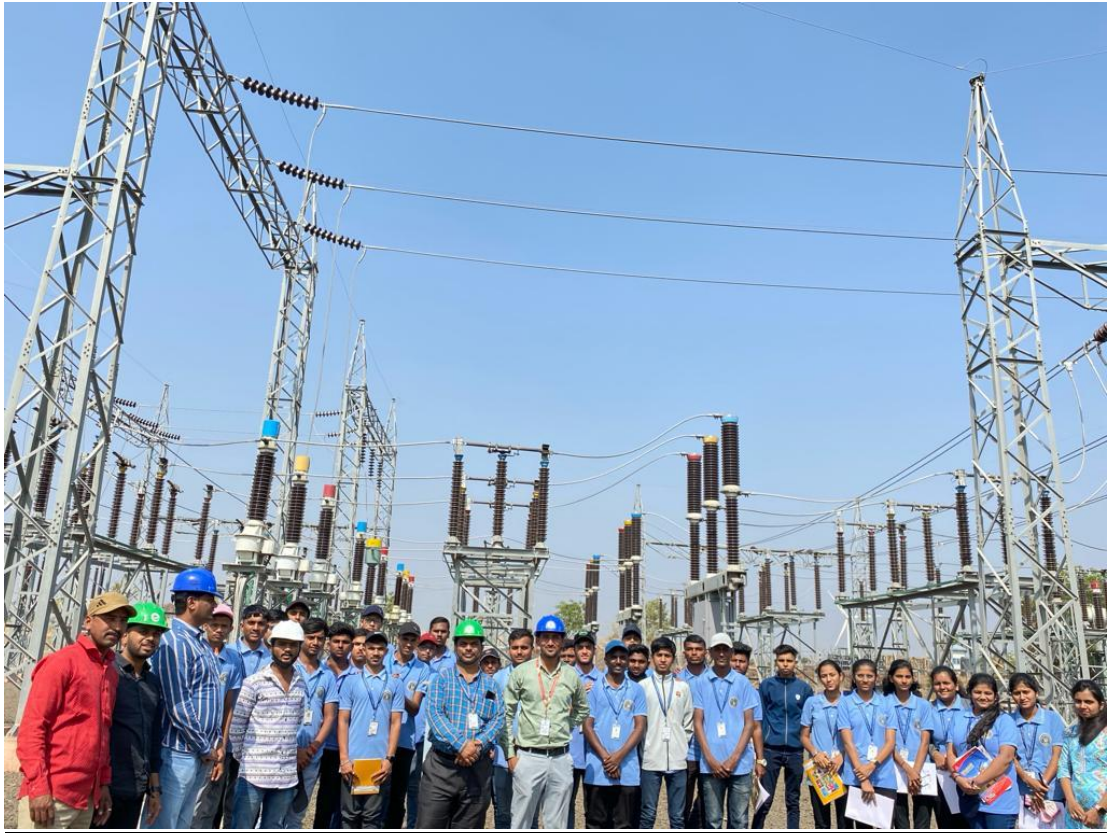
Renew Extra High Voltage Power Substation, Walsang road, Jath Sangali1, Maharashtra