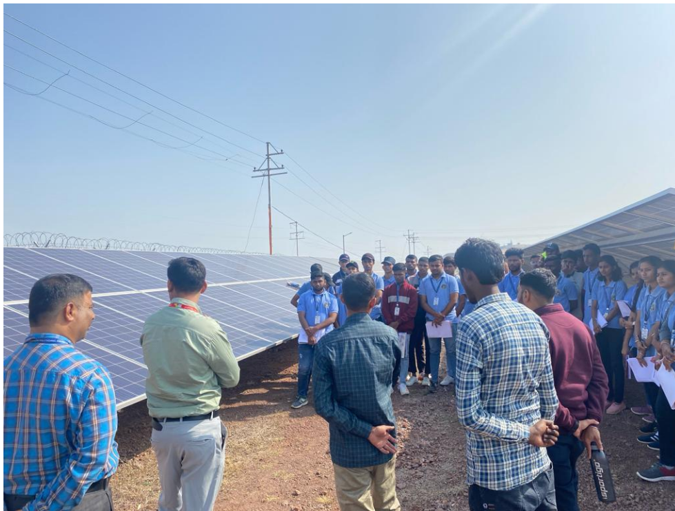
TATA solar power plant, Walekhindi, Jath Sangali1, Maharashtra