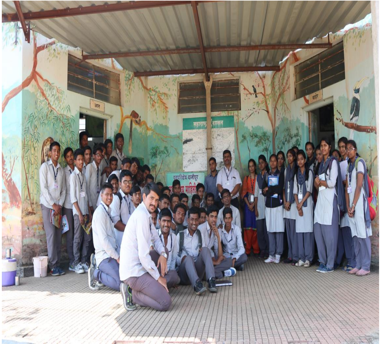
Field visit at Dajipur Forest exhibition Centre-Maharashtra Forest dept. officers explaining our students.