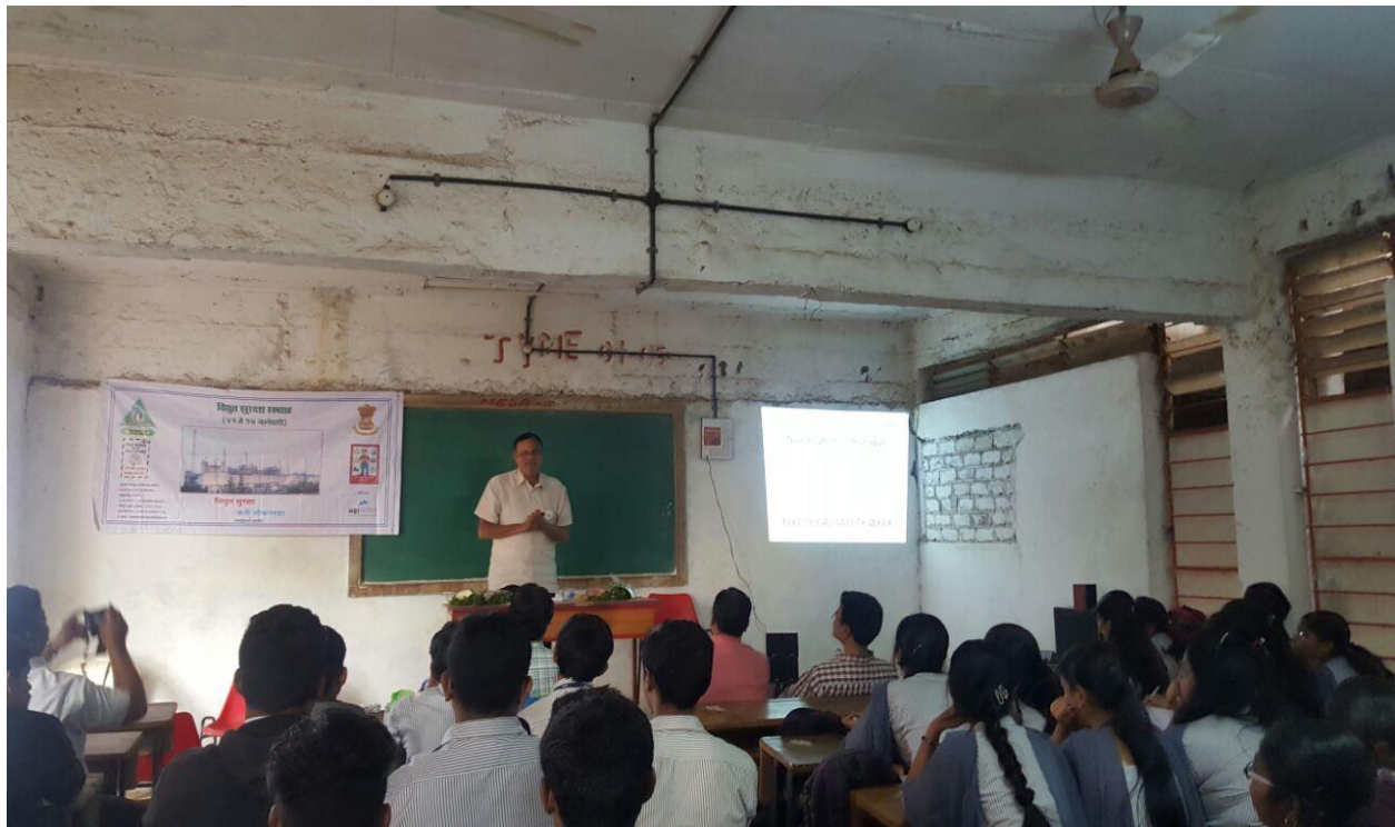
Safety Week celebration at Electrical department under guidelines of the "Electrical Contracting Association of Kolhapur district"