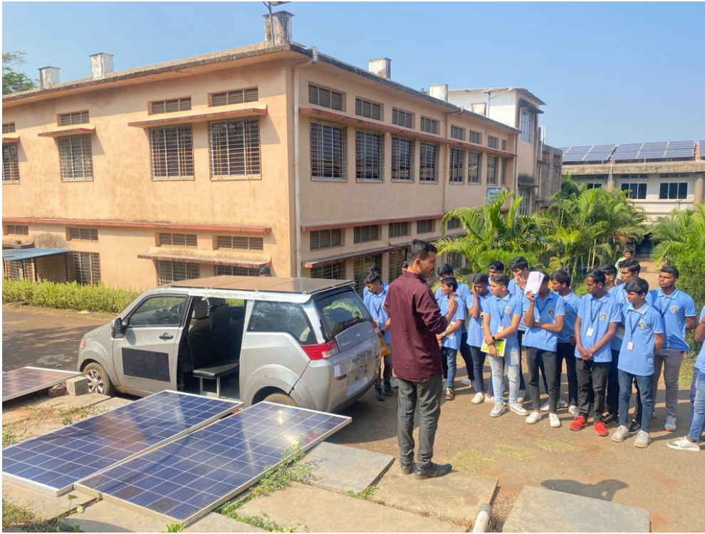
Hoshang Patel Tech. Center, Gharada Institute of Technology, (Solar Manufacturer ), Ratanagiri, Chipalun3 Maharashtra