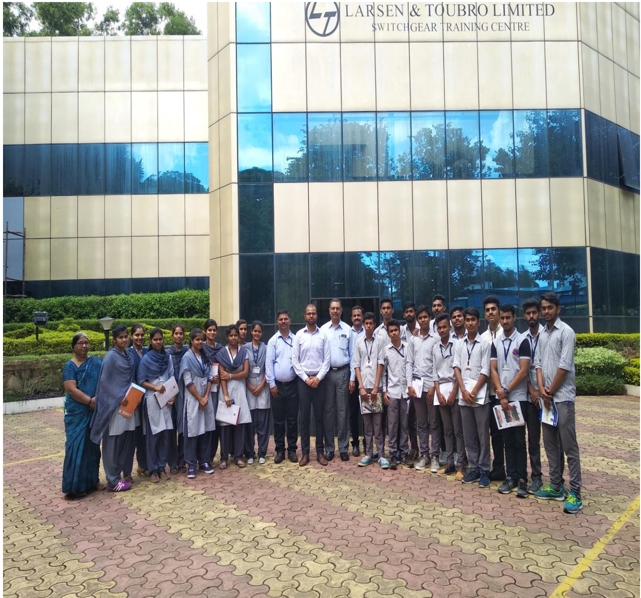
One day workshop at L&T Switchgear Training Centre Pune.