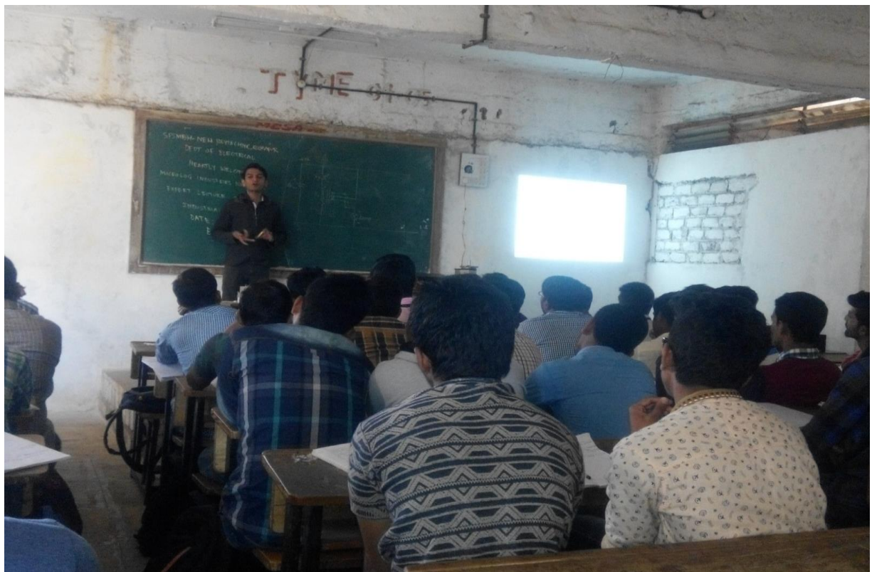
MICROLOG INDUSTRIES WORKSHOP ON PLC -MOU ACTIVITY