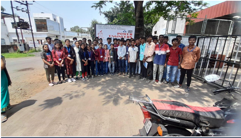
Industrial visit at Power Engineers Gokul Shirgaon on 21 st April 2022