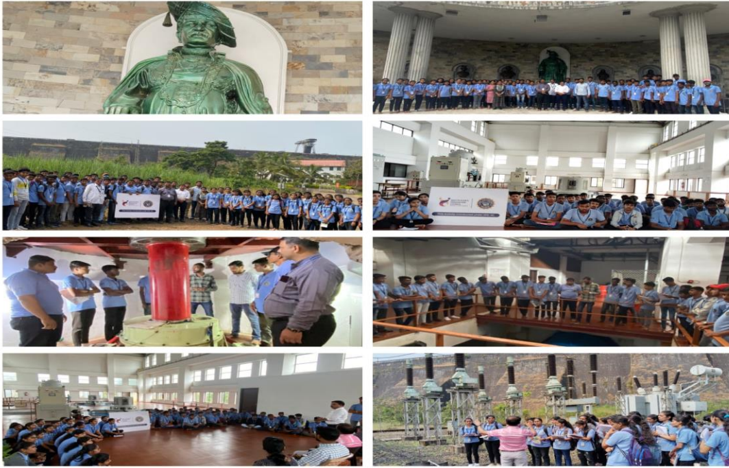
22_10_2023 R. M. Mohite Hydro Power Plant, Radhanagari, Kolhapur, Maharashtra