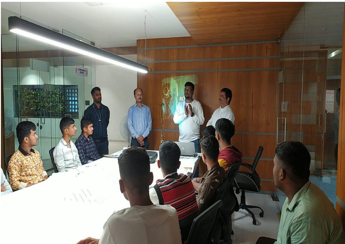
Workshop on aerospace and robotics application in electrical engineering. ( RnT Robotics )