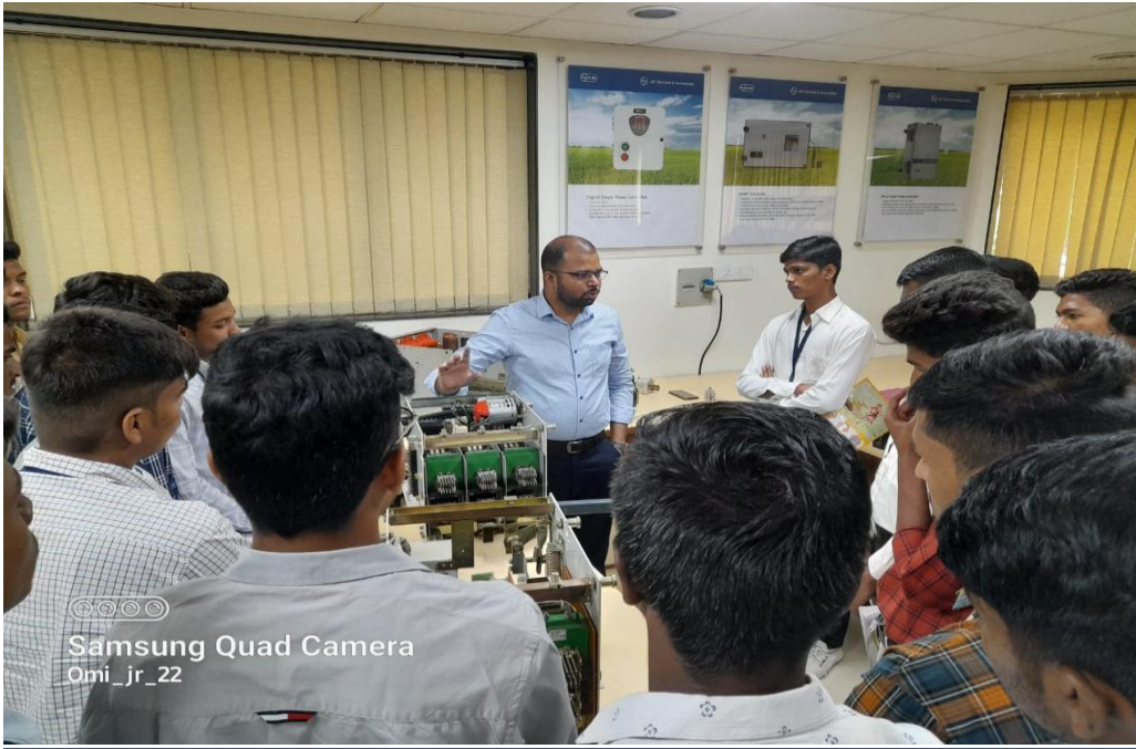
Educational visit at L&T Pune on 13 th to 16 th May 2022