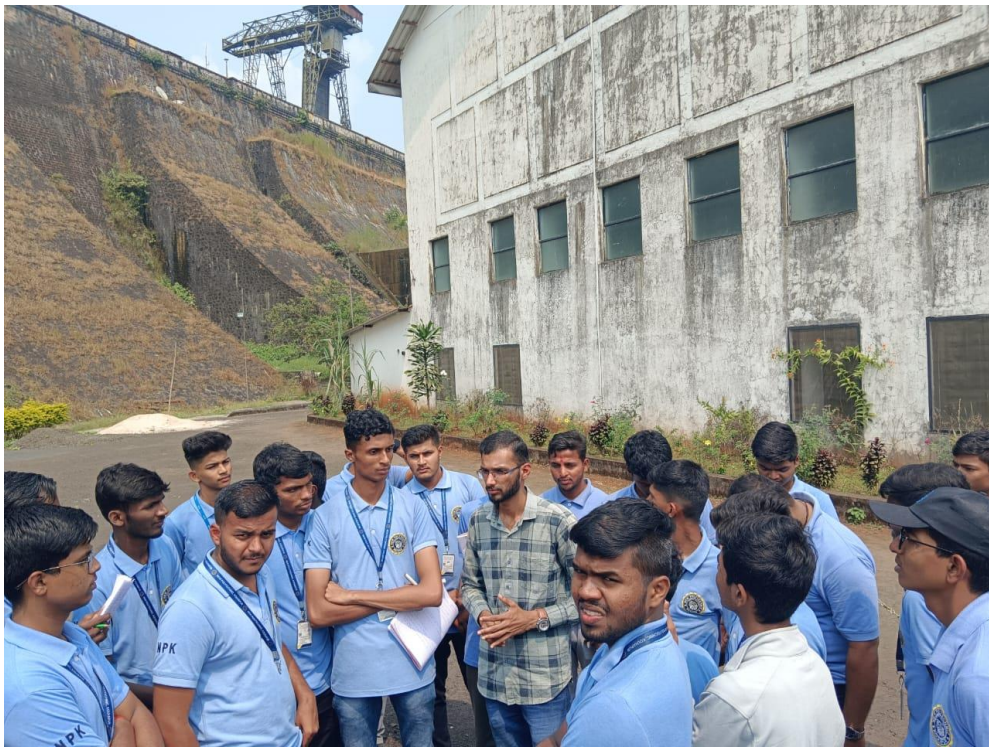
22_10_2023 R. M. Mohite Hydro Power Plant-1 Radhanagari, Kolhapur, Maharashtra