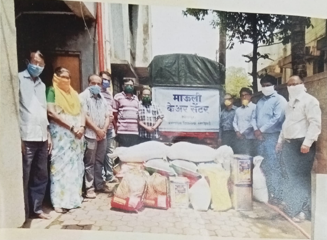
Grocery Donation to Maulee Care Centre, Kolhapur initiated by Department of Civil Engineering